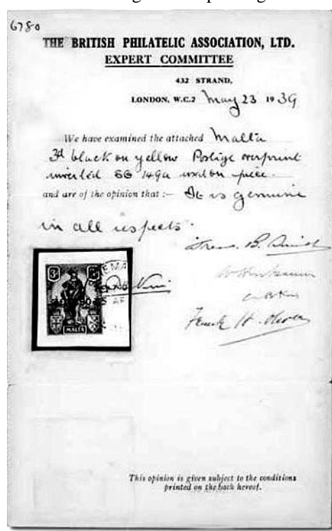
Fig. 1. The British Philatelic Association's confirmation of the stamp as being genuine.