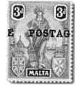
Fig. 2. Examples of the 'POSTAGE' inverted 3d stamp.