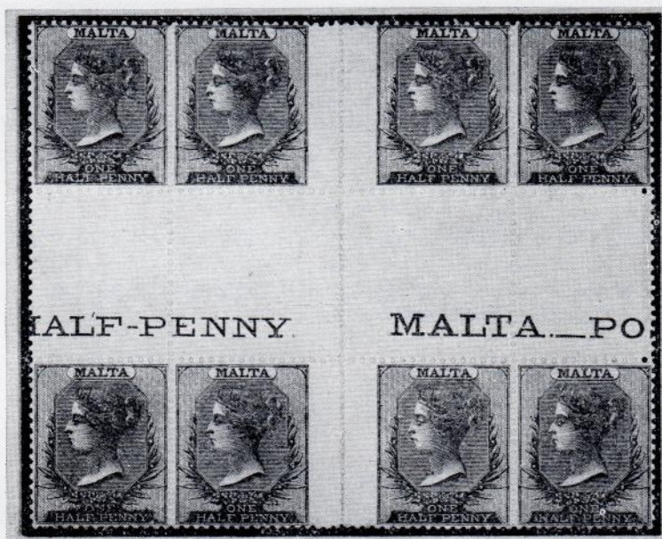
Interpanneau Block of Eight of the Yellow-buff (Wmk. CC., Perf. 14) showing part of the imprint MALTA POSTAGE ONE HALFPENNY.

Over the years there has been doubt and controversy concerning the number of printings and dates of issue of this stamp but it is hoped that the information now published will establish the number of printings in chronological order. There were actually twenty-nine yellow printings and one green printing (that being between the 28th and 30th).